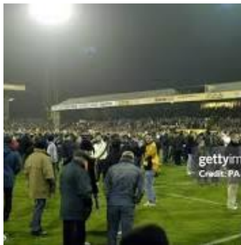
Memories were mourned with the end of Boothferry Park, soon the ground was left to fate before the housing development followed.