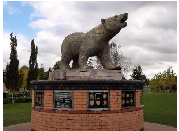
The Impressive Polar Bear Memorial