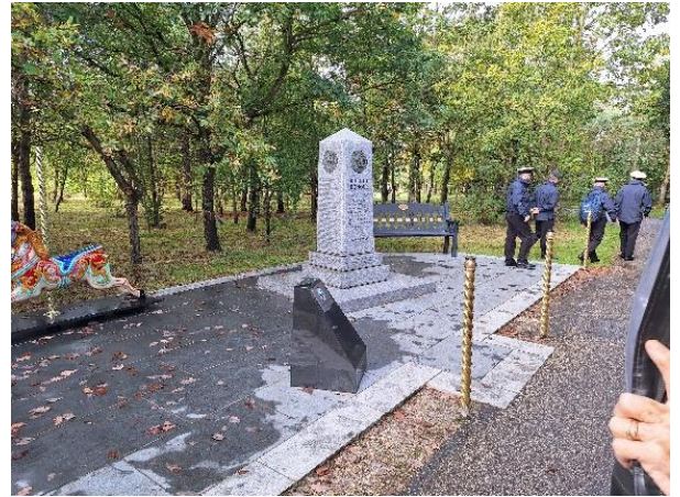
The wonderful Showmen's Guild National Memorial