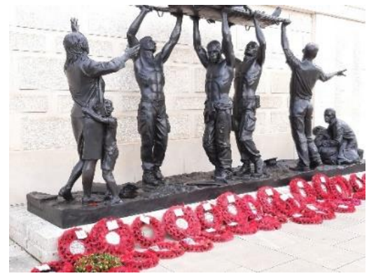
Soldiers carrying a wounded colleague back to safety.