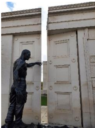
From the main Memorial: the open door through which the sun breaks on the Eleventh Hour of the Eleventh month