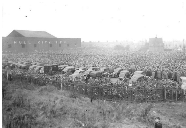
The crowds at BP for Manchester United's visit in 1949.

Not since the 6th round tie with Manchester United in 1949 did a game capture the excitement and expectation of the East Yorkshire public.