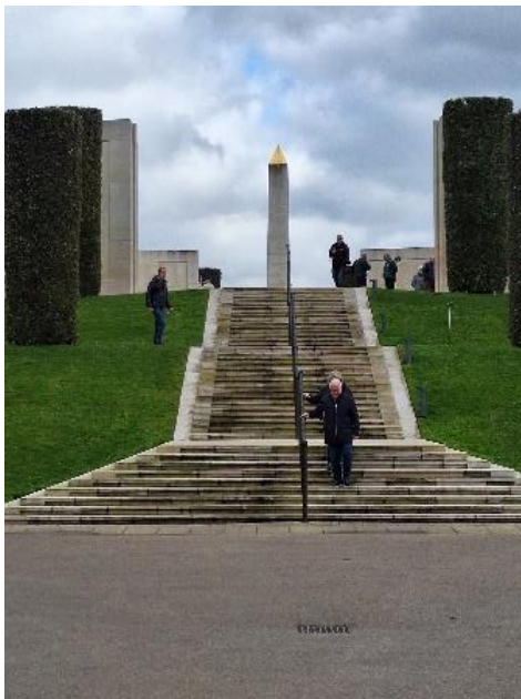
Steps leading up to the Main memorial.