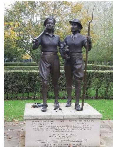
The Memorial to the Woman's Land Army and the Women's Timber Corps.