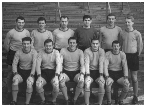
The Tigers from the 'Never to be Forgotten Season: 1965-66

Senior Tigers memorabilia and heritage Coordinator.