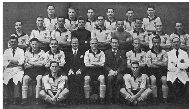
Hull City 1948-49

I have enjoyed many great seasons but the one I have chosen is the one my Dad used to talk about and gave great pleasure to so many people following the difficult years of World War 2. It is also a season I know some of our members still fondly remember. It is the season where Player Manager Raich Carter leads the Tigers from Division 3 North to promotion and an FA Cup Quarter Final. It was season 1948-49 , the 3 rd season in the hastily built Boothferry Park, a season which witnessed a home crowd of over 50,000.