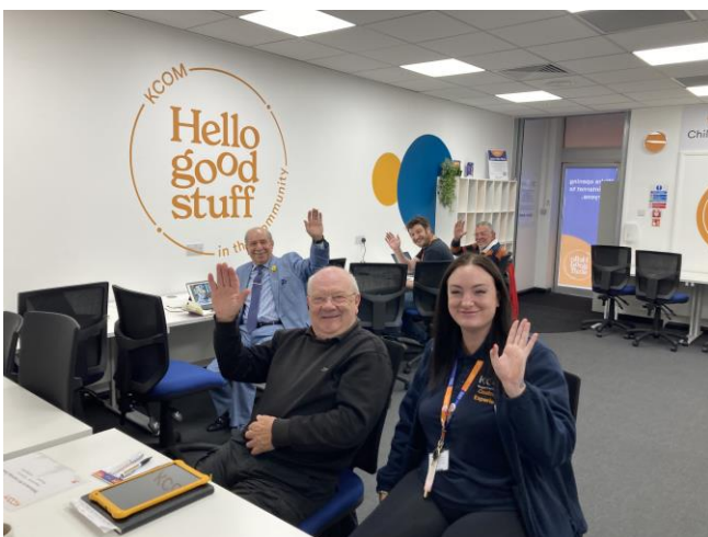
Attendees at the June Drop-in Session